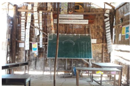
The ramshackle classrooms are neither a comfortable nor a motivating environment for the students