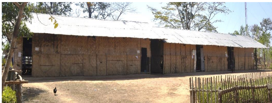
The two temporary bamboo buildings are in a state of great despair and in dire need of replacement. There is a real danger that the builds will collapse anytime soon