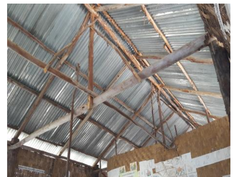
The timber roof trusses are severely damaged from the leaking rain water