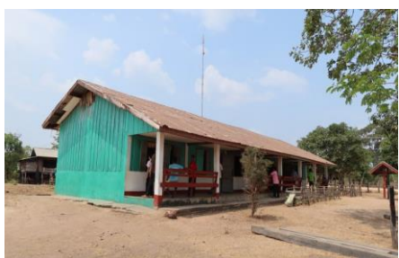
The ramshackle buildings, built by the community in 2000 (top) and in 2011 (bottom), are in a state of great despair with severe structural damage, and in dire need of replacement.