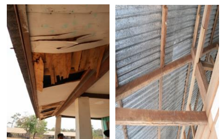
The ceiling of one of the school buildings and roof trusses are infested with termites and on the verge of collapsing, endangering children attending classes.