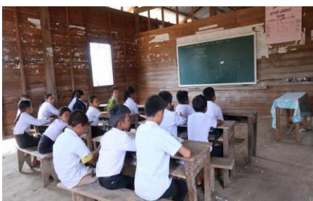
Students attending class in one of the classrooms at Khok Kong Primary School. This environment is not conducive for learning.