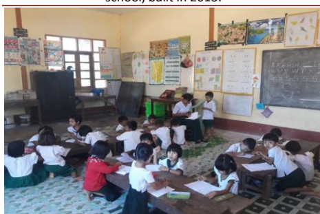
Students can study in a safe environment, but space is limited and amenities are sparse.