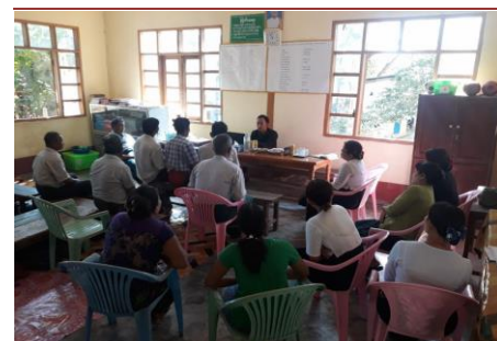
Members of the staff and community meet with a Child's Dream representative to discuss the new school building.