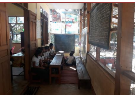
To alleviate the overcrowding, some students must have their lessons in the hallway.