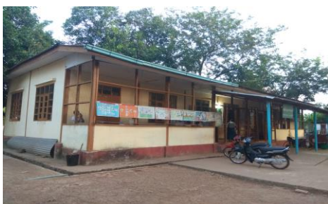
The only school building of Kawt Ga Rod primary school, built in 2013.