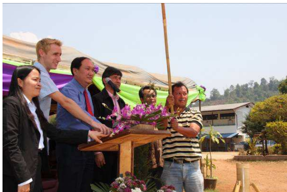
Opening ceremony in Maeded Noi

In the beginning of April I joined a boarding-house opening ceremony in Maeded Noi. Another wonderful experience! The trip itself was already amazing, the scenery was incredibly beautiful and I can only imagine how stunning it must be during the rainy season or during the winter months. Buddhist monks were present for the ceremony, there were many official speeches and the overall ambiance was very festively, thus the food which was served was absolutely delicious ☺. It was quite rewarding to have experienced this opening!